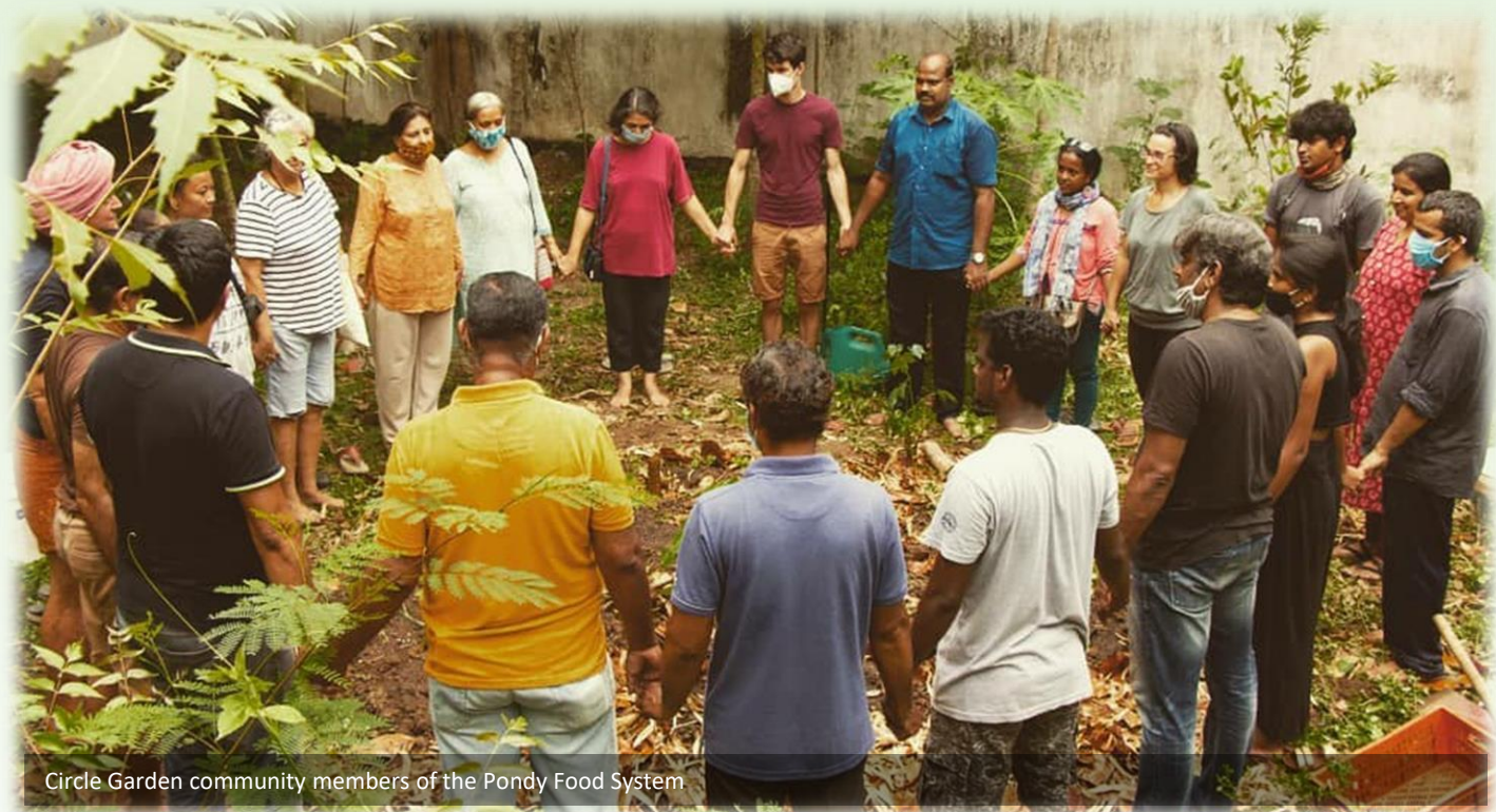
Circle Garden community members of the Pondy Food System

Growth will not be a pyramid with the apex (the top of the pyramid-Privileged) sustained by the bottom (Underprivileged). But it will be an oceanic circle whose centre will be the individual. Therefore the outermost circumference will not wield power to crush the inner circle but will give strength to all within and derive its own strength from it.