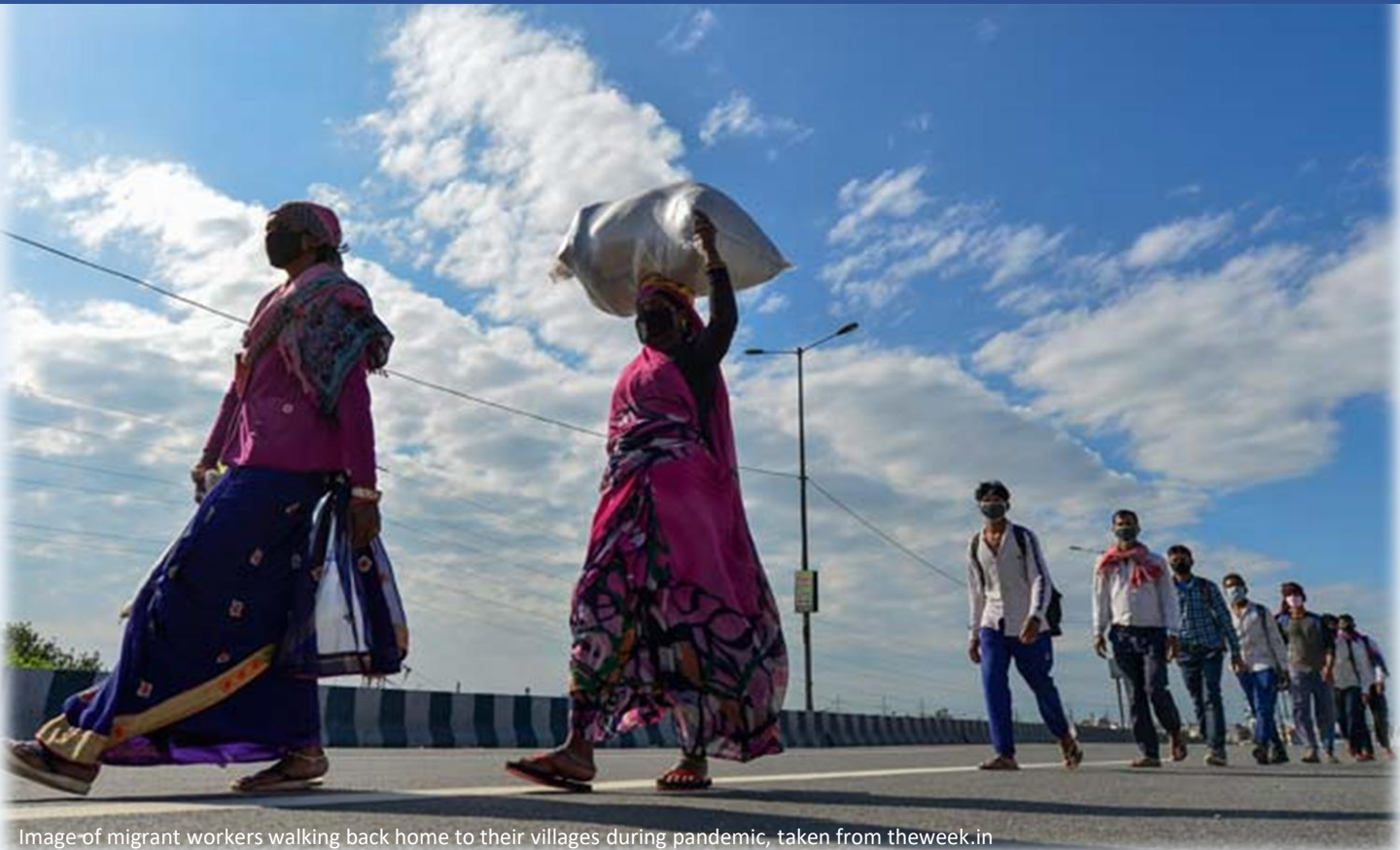
Image of migrant workers walking back home to their villages during pandemic, taken from theweek.in

But there is no end to the victims destroyed in the fire of civilization. Its deadly effect is that people come under its scorching flames believing it to be all good. They become utterly irreligious and, in reality, derive little advantage from the world. Civilization is like a mouse gnawing while it is soothing us.