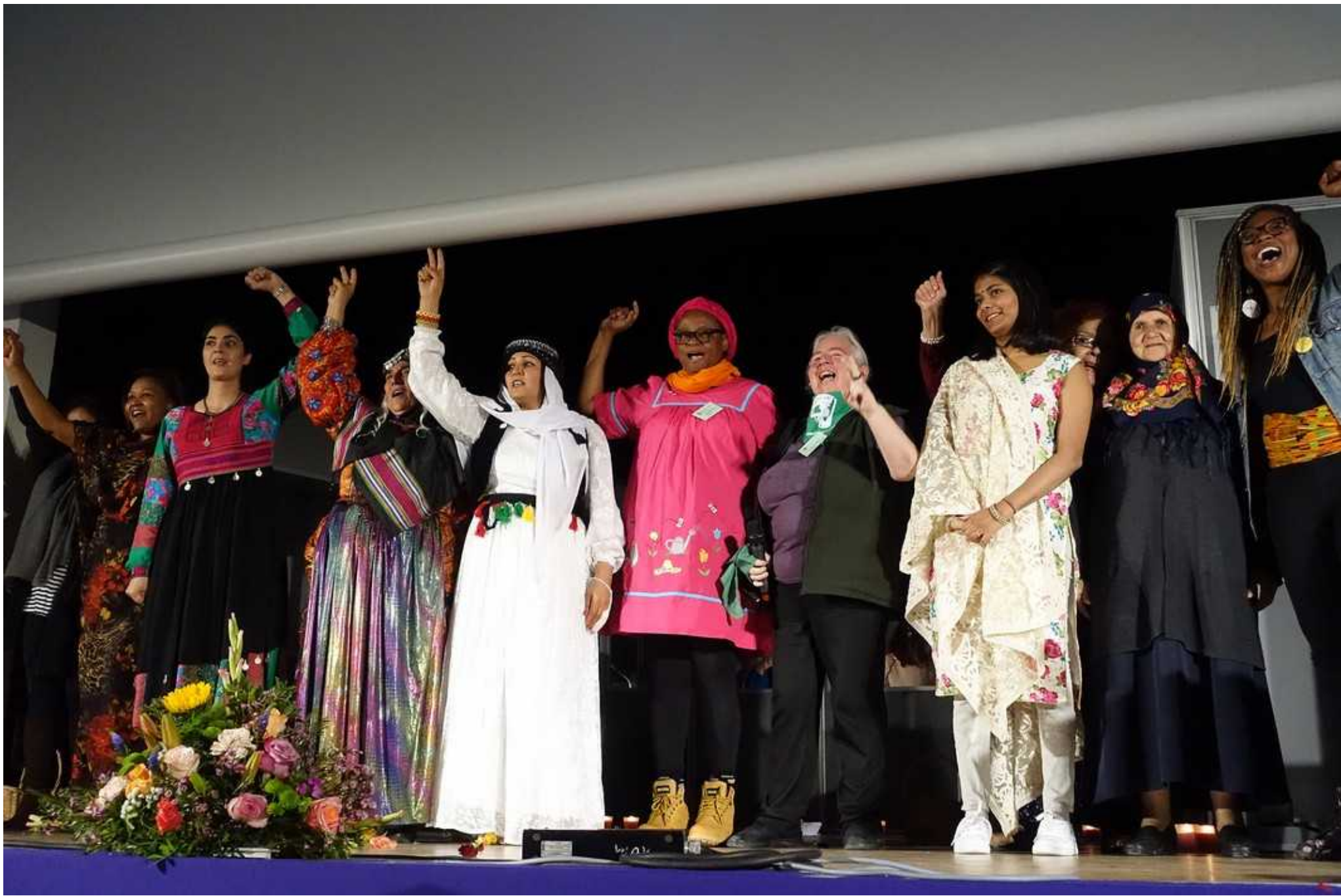
International women's conference 2018, organized by kurdish women's movement