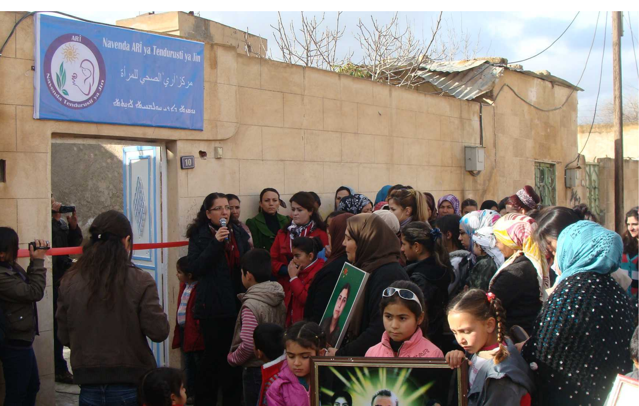
Women's health centers