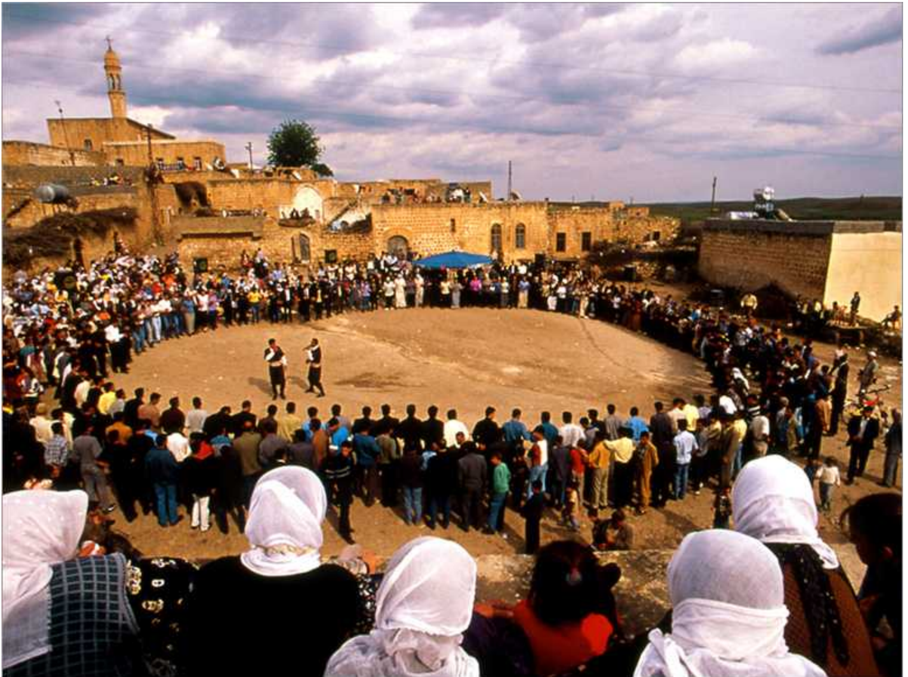
Kurdish traditional dance