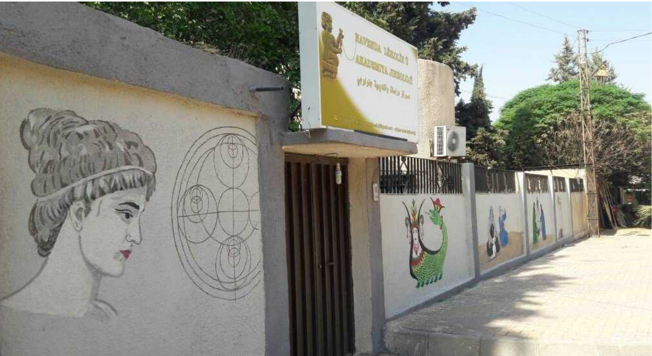
Local academy and research center of JINEOLOJÎ