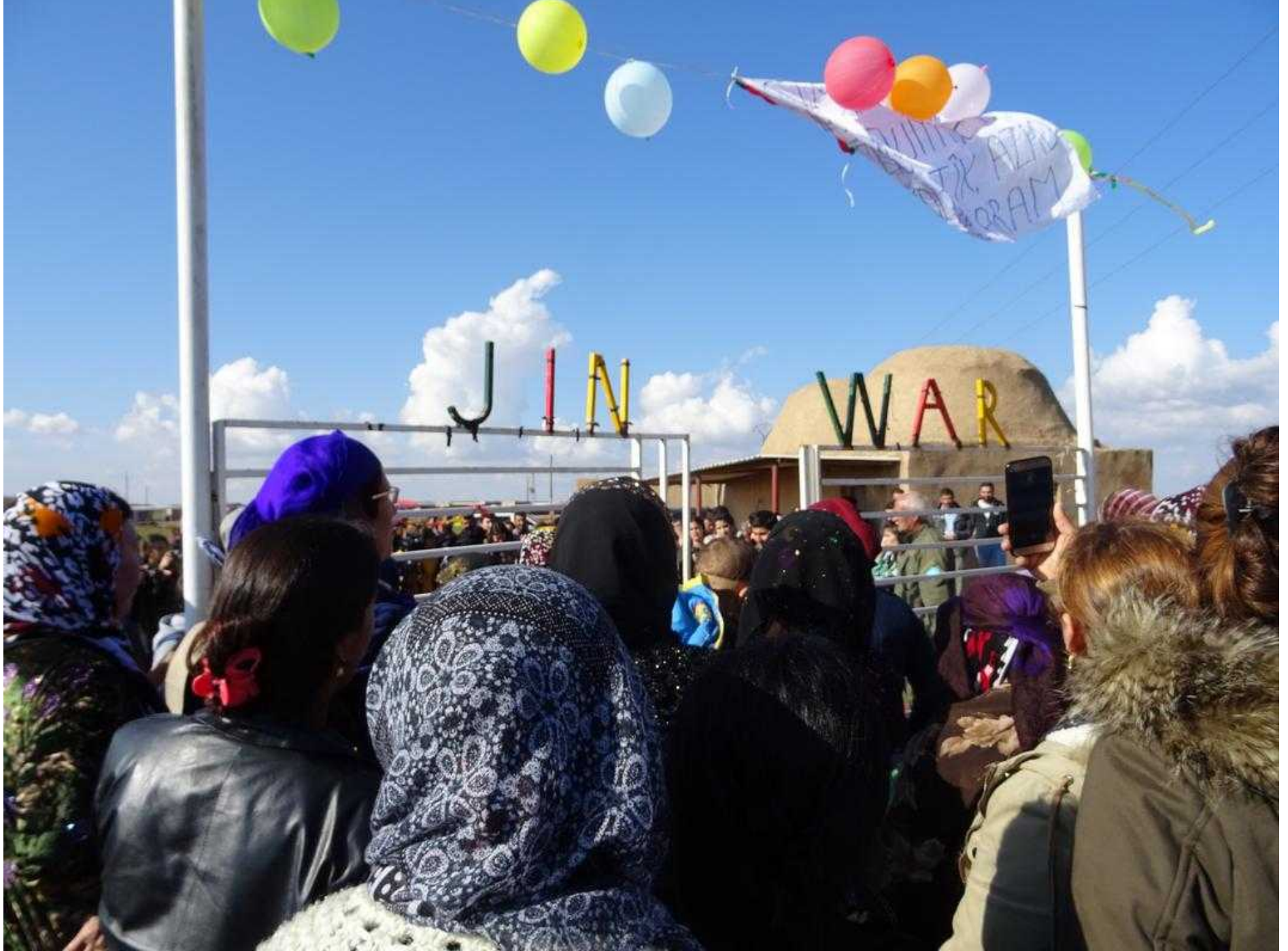
Celebration for opening of JINWAR, the women's village in Rojava