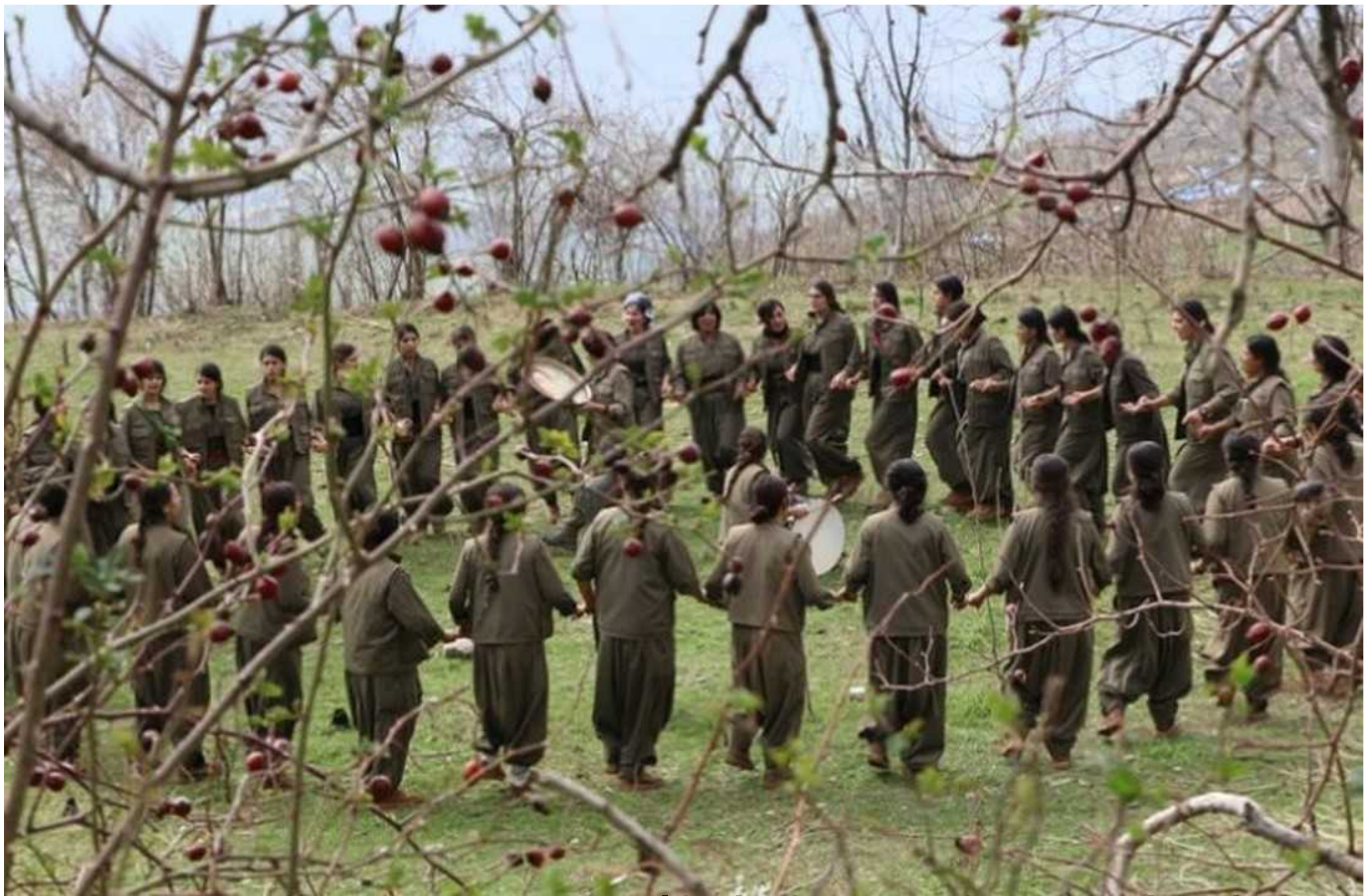
Dance of Women's self-defense forces in the Kurdish mountains