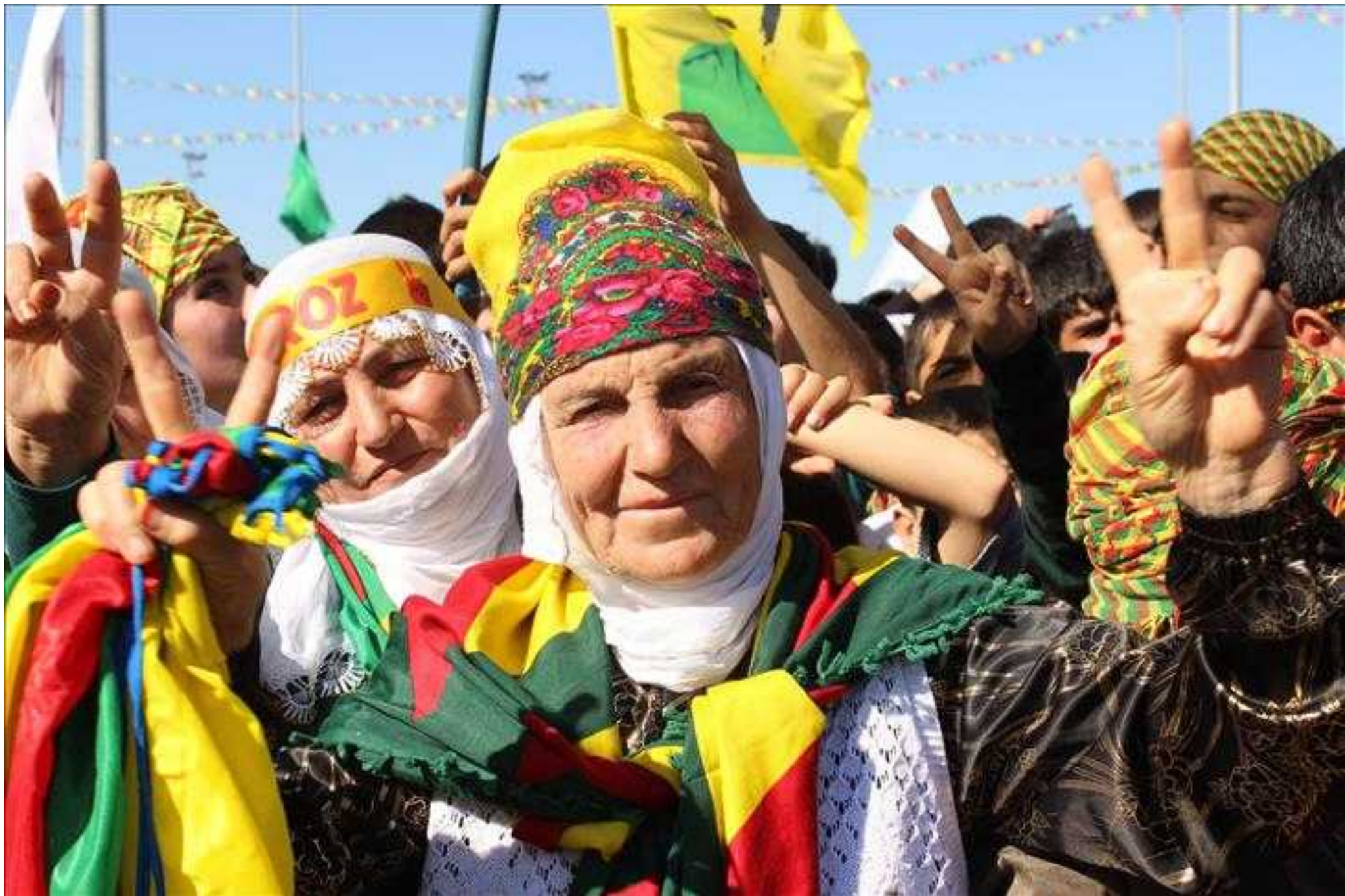
In turkey the kurdish colours green-red-yellow are forbidden – Kurdish women are avantgarde in fighting against this ban