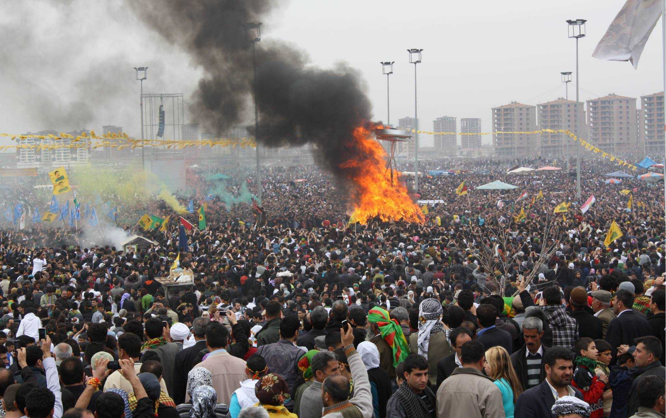
Newroz-Celebration: the most important holiday of the kurdish society, celebration is forbidden in Turkey