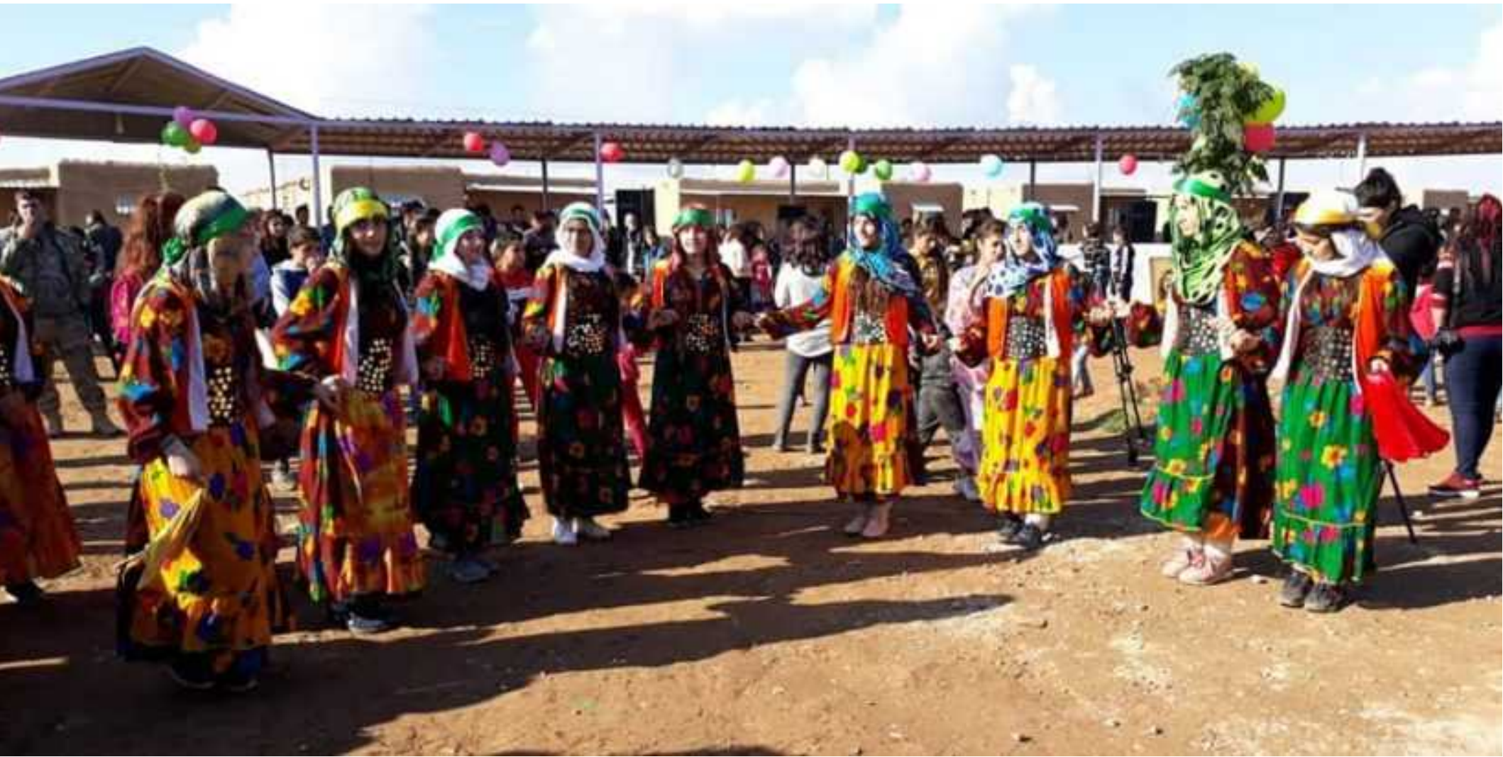
Traditional Kurdish clothes and dance – opening ceremony of JINWAR