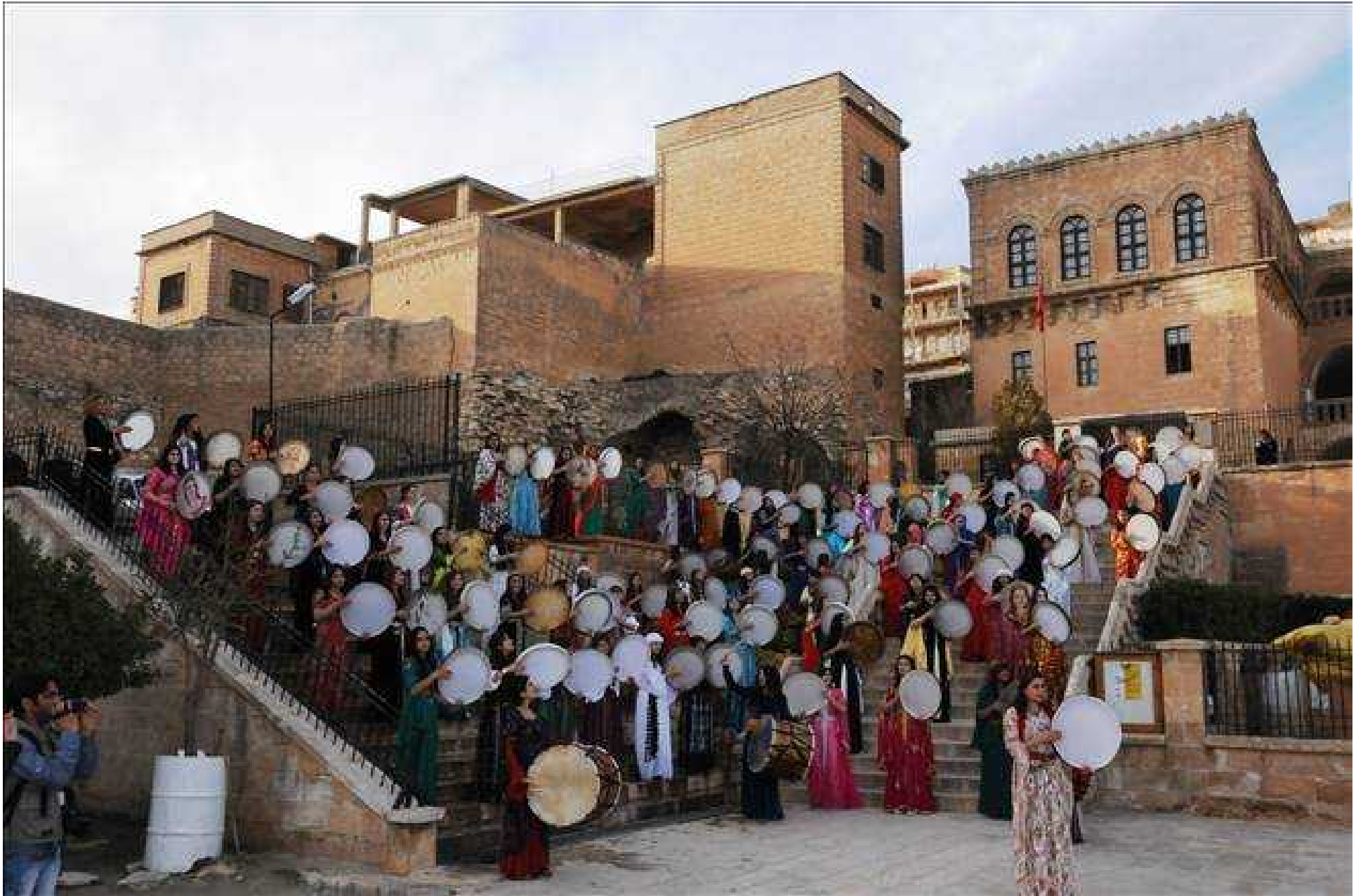
Marche mondiale femmes in Bakûr (Turkey): performance of Kurdish music