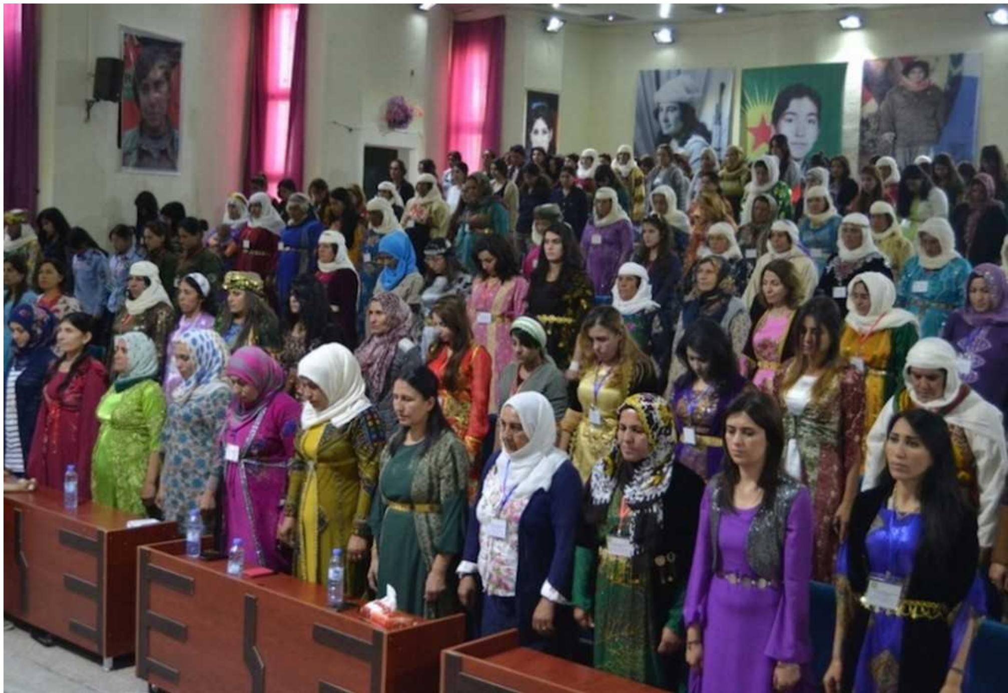
Congres of the autonomous women's councils on cantonal level