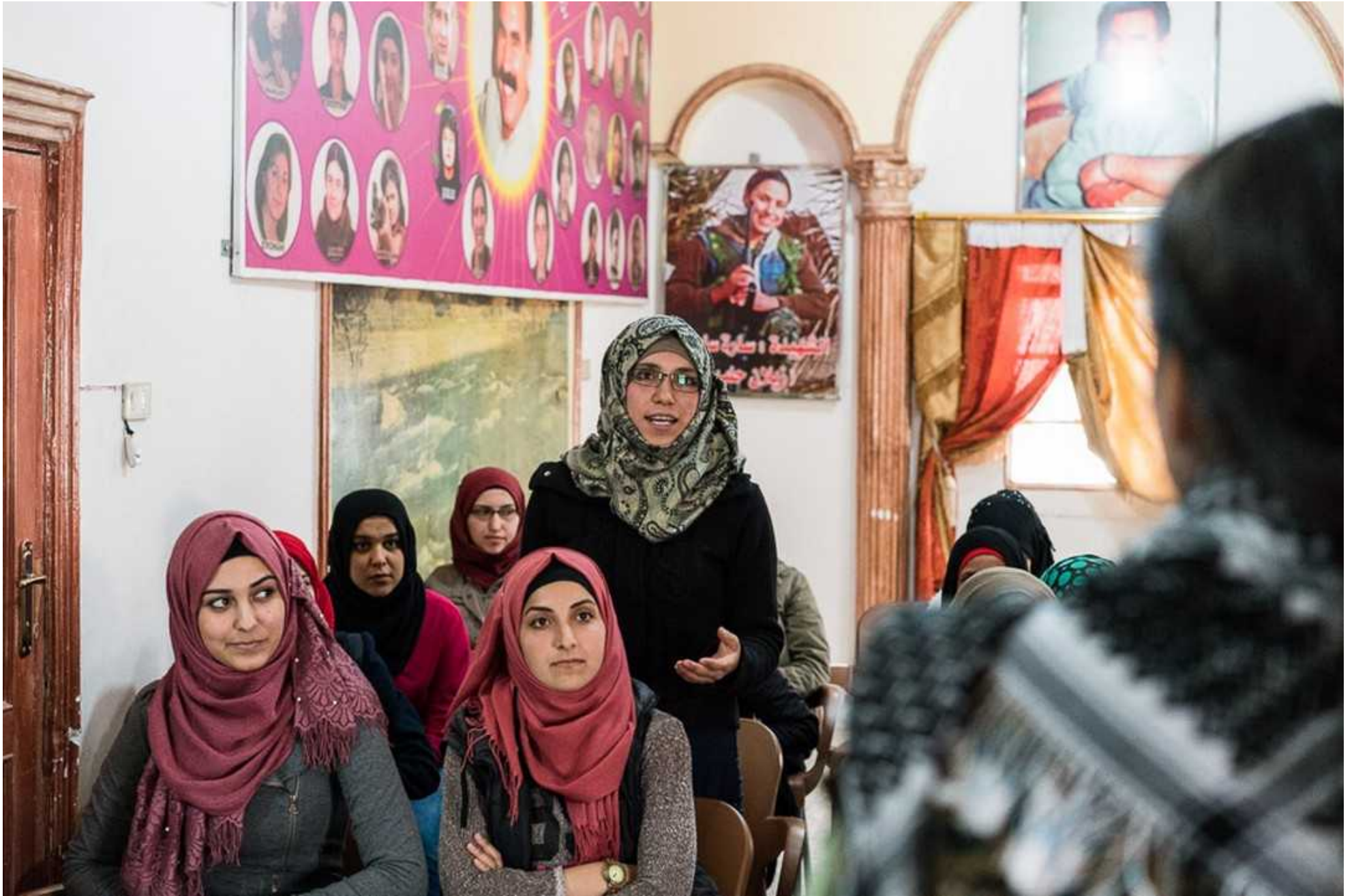
Meeting of women's council: women are solving their problems locally and autonomous