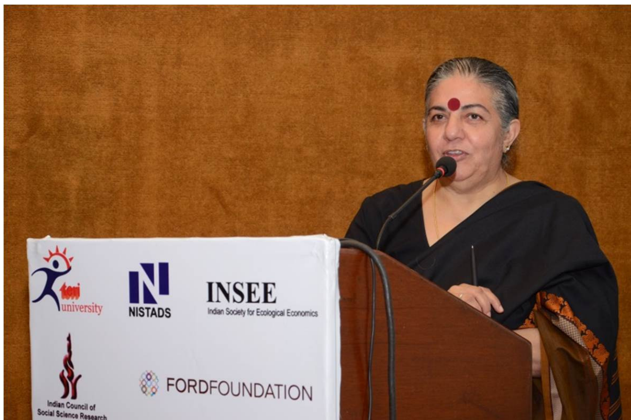
Vandana Shiva (keynote)