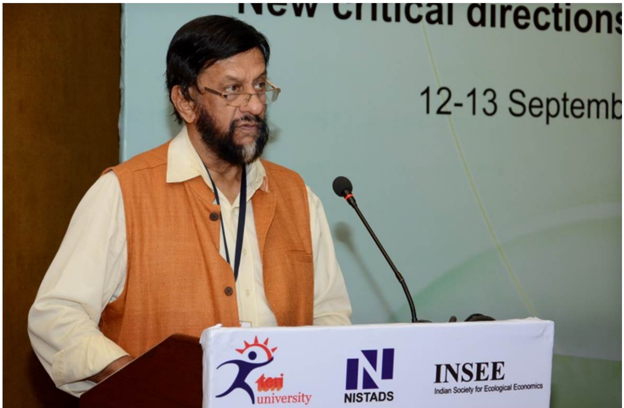
Inaugural address by R.K. Pachauri