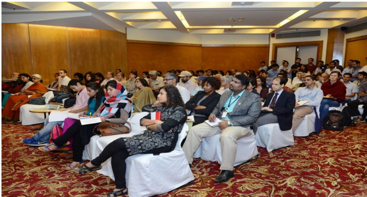
The audience on September 12, 2014