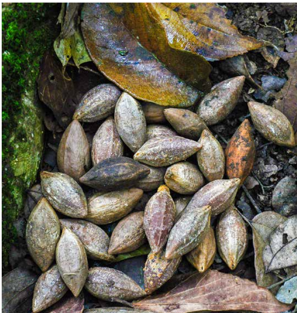
Canarium strictum seeds