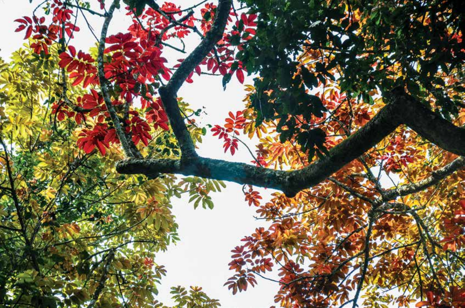
Canarium strictum foliage