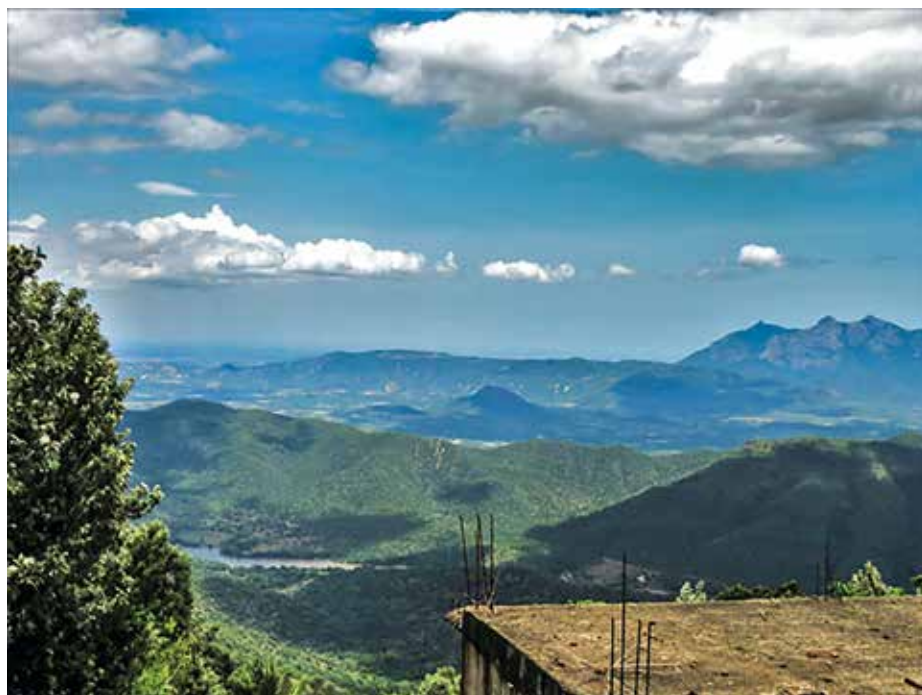
Looking into the landscape of Irula stories – The Pillur region; Photo courtest – A Meena

Additional Coordinator, Conservation, Keystone Foundation