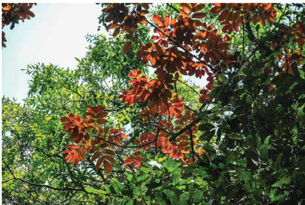
Canarium strictum foliage