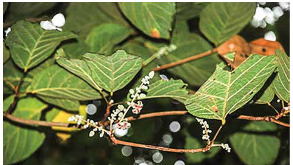
Leaves, flower and young fruit; notice lowest secondary nerves are basal

A man walked towards me from a distance. He was a Kattunaikan man and he stopped when he saw that I wanted to know something. I asked whether he knew the tree, whether he used it, what the fruit were like, and a host of other questions. He said that he knew the tree, they called it chotta in their language; that the fruit was fairly big and red with a hard shell (he used the word odu ), that the shell opened by itself when mature, and it had black seeds inside. While we spoke another man came up – he was a Paniyar person – and joined our little conversation. He confirmed what the Kattunaicken man had said, only adding that the Paniyar people roasted the seeds and ate them. The Paniyar name for the tree was the same as in Malayalam, thalanthatta . I