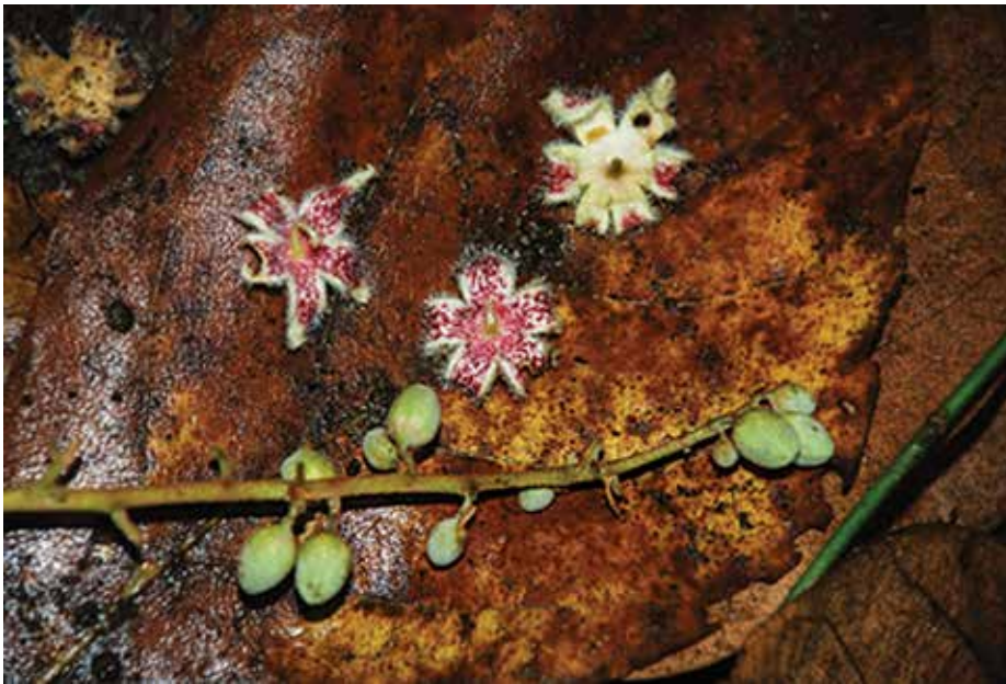
Flowers, right side up and upside down, and young fruit, on a dried leaf